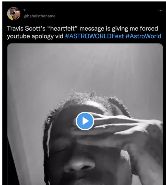
Figure 2. Tweet by user ° (@babaisthename) in response to Travis Scott's video regarding the Astroworld tragedy (°, 2021).

06 and any time I could make out, you know, anything that's going on, you know, I'd 07 you know, I'd stop the show and you know, help them get the help they need, 08 you know? Um... I could just never imagine the severity of the situation. Um... [jump cut] 09 We've been working closely... [sigh] we've been working closely with everyone 10 to just try to get to the bottom of this, 11 just city of Houston, HPD, fire department, you know, everyone to, you know, 12 help us... help us figure this out. 13 So if you, if you have any information, um... you know, 14 please just contact the local authorities. 15 Um... everybody continue to just keep your prayers. [jump cut] 16 I mean, I'm honestly just devastated, I could never imagine 17 anything like this just... happening. [inhale] 18 I'm gonna do everything I can to keep you guys updated, and 19 just keep you guys informed on what's going on. Um... 20 [sigh] Love you all.